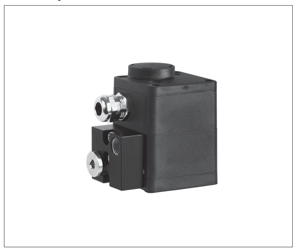
Type 3967 Solenoid Valve